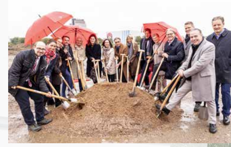
Ground-breaking ceremony, October 2019

With the TEEKANNE Tea Processing Centre, the company's guiding principle 'ALL FROM ONE SOURCE – everything from one single source' becomes even more concrete. The new building is being built right next to TEEKANNE's headquarters in Düsseldorf and is directly connected to the production department of the most up-todate tea factory in Europe. The new building will optimise processing procedures from the receipt of raw materials through to delivery, and secure the long-term product quality of the TEEKANNE brand. At present, roofers and façade builders are already working on the pre-conditioning of the incoming goods department. Work is also progressing rapidly on the new, ultra-modern high-bay warehouse. The foundation will be completely finished by Christmas, after which the steel structure for the warehouse will be erected in January.