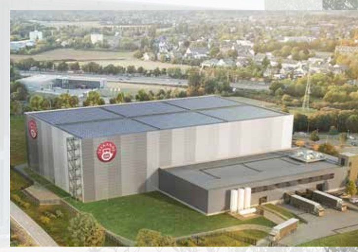
This is what the TEEKANNE Tea Processing Centre will look like one day.